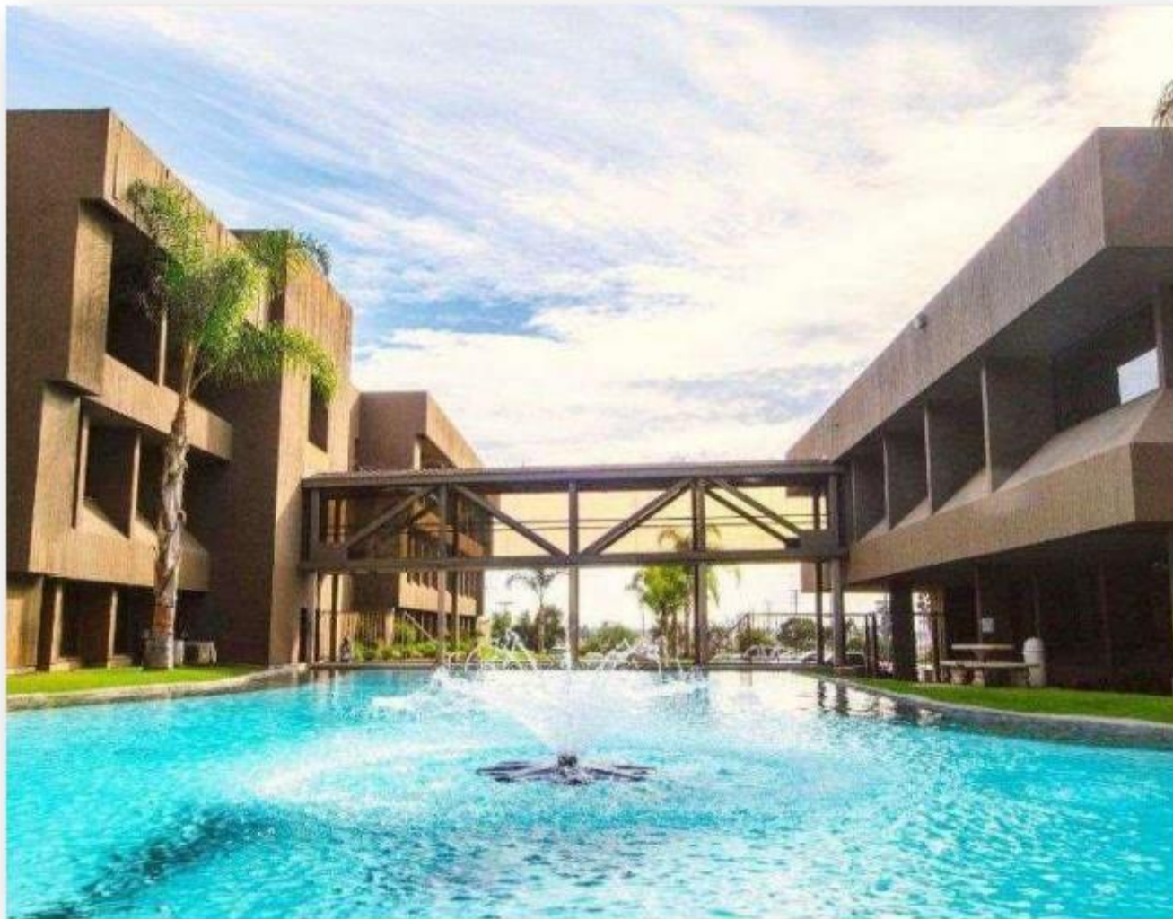
AUHS Building 2 and 3

"Trust in the Lord with all your hearts, and do not lean on your own understanding." ~ Proverbs 3:5