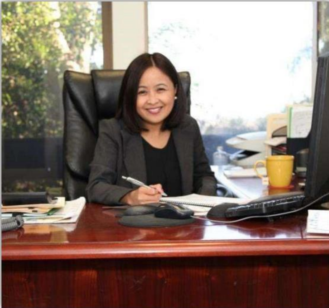
Office of the Student Affairs and Services