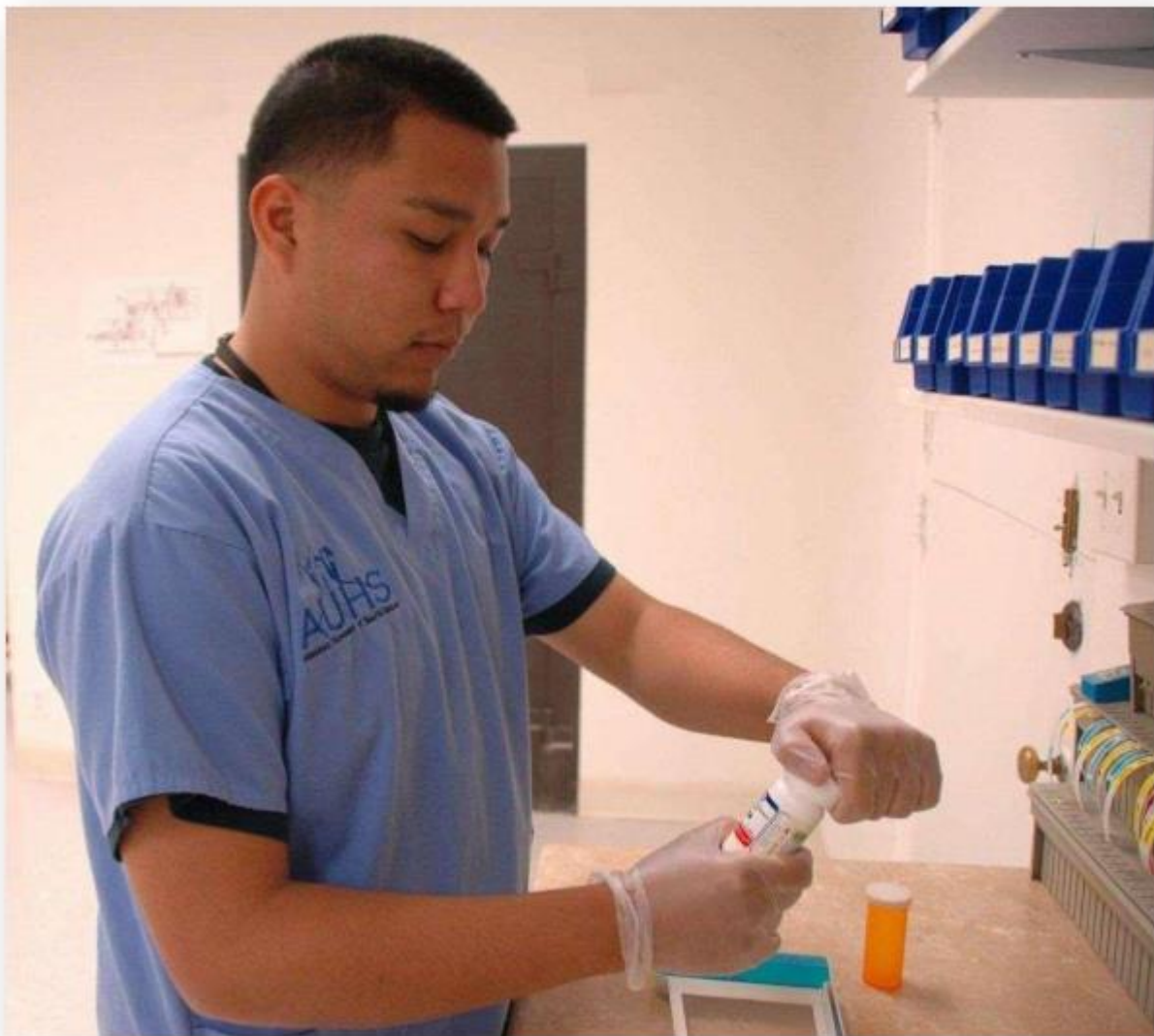
Prescription Dispensing Laboratory

Praise the LORD. Praise God in his sanctuary; praise him in his mighty heavens. Praise him for his acts of power; praise him for his surpassing greatness. Praise him with the sounding of the trumpet, praise him with the harp and lyre, praise him with timbrel and dancing, praise him with the strings and pipe, praise him with the clash of cymbals, praise him with resounding cymbals. Let everything that has breath praise the LORD. Praise the LORD. ~Psalm 150:1-6