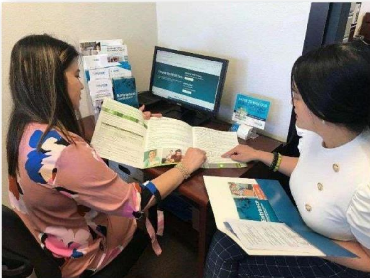
Financial Aid Department

Help, LORD, for no one is faithful anymore; those who are loyal have vanished from the human race. Everyone lies to their neighbor; they flatter with their lips but harbor deception in their hearts. ~ Psalm 12:1-2