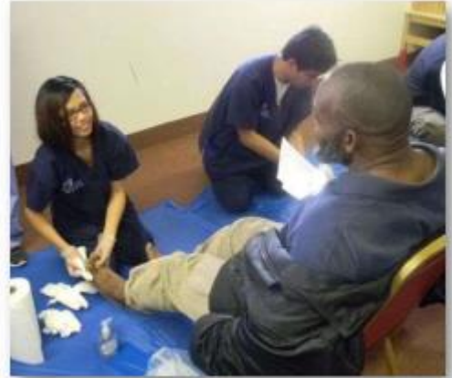
Community Service-A Core AUHS

~ Martin Luther King Jr., Strength to Love