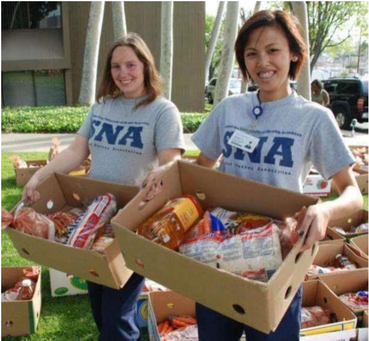
Nursing Students giving away meals for the “Acts of Love” holiday event.

That all might have the chance to believe, to learn, to create, to succeed.