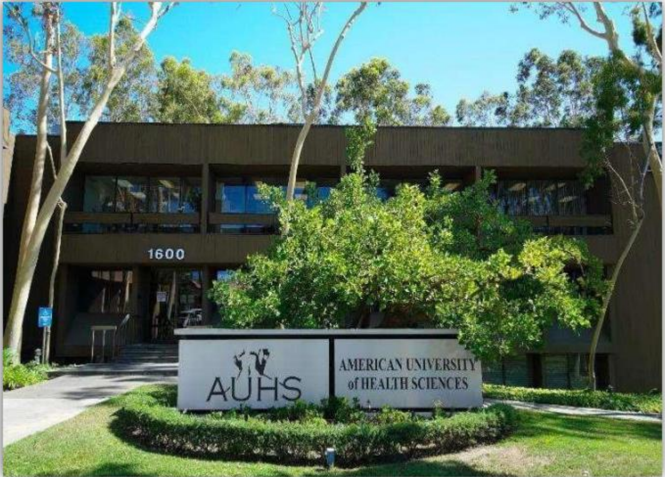
Front Façade, American University of Health Sciences Campus