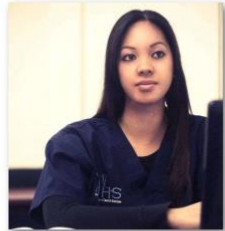
Student, School of Nursing during lecture

The student is held responsible for submission of one of the required documents below to Admissions Department for transfer credit verification and evaluation.