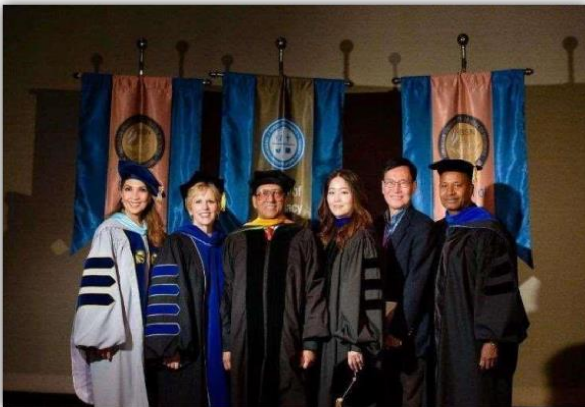
AUHS Commencement 2024

"Therefore, my dear brothers, stand firm. Let nothing move you. Always give yourselves fully to the work of the Lord, because you know that your labor in the Lord is not in vain." ~ 1 Corinthians 15:58