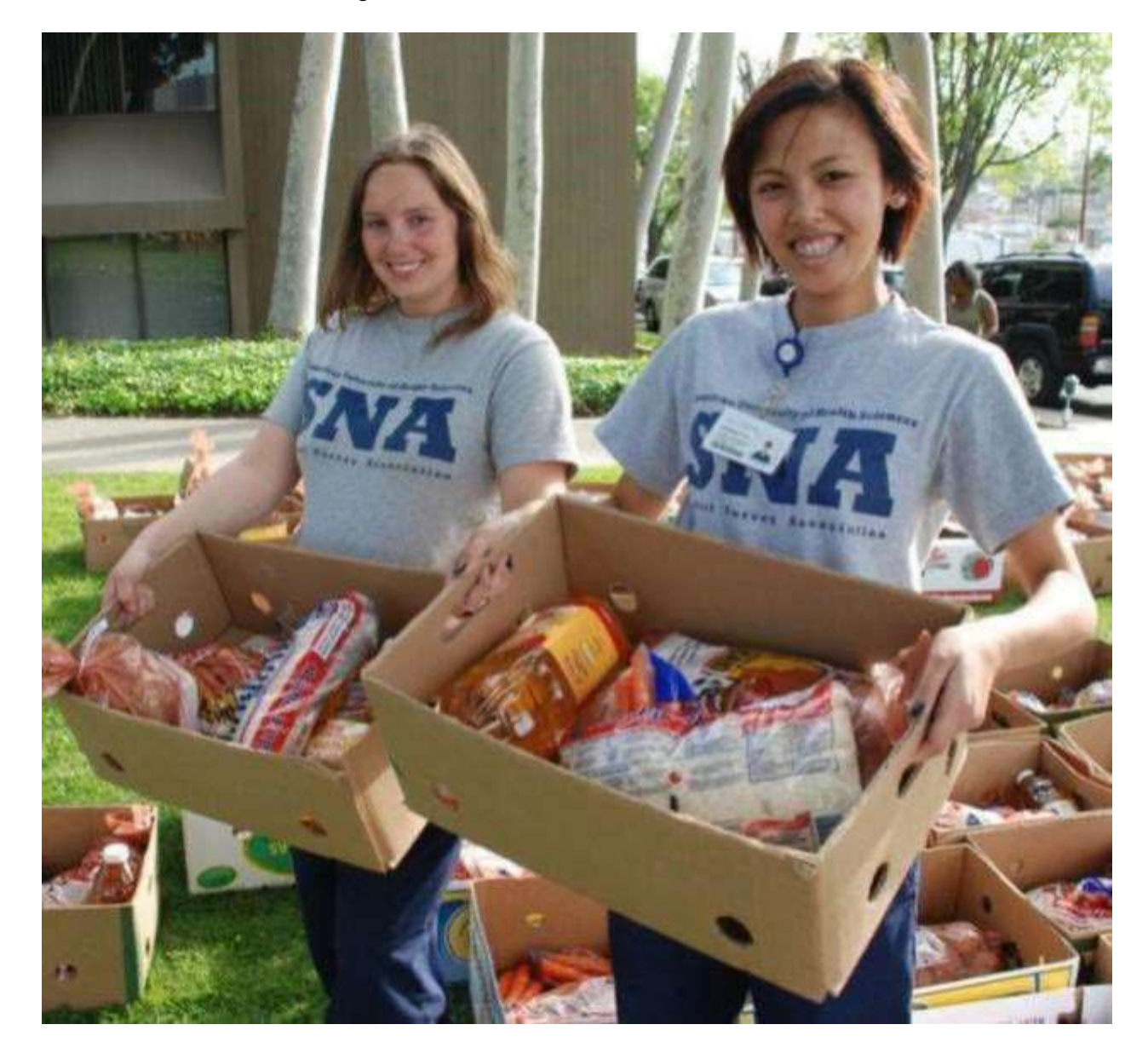
Nursing Students giving away meals for the "Acts of Love" holiday event.

There is a dream that each of us has inside. It speaks of a better time, of a better life, of a better world. There is a voice that comes from God and shows to each, "the way", then say, "come abide". There is a need that cries, must be satisfied, requires of us to care, to help, to give, set selfaside. That all might have the chance to believe, to learn, to create, to succeed.