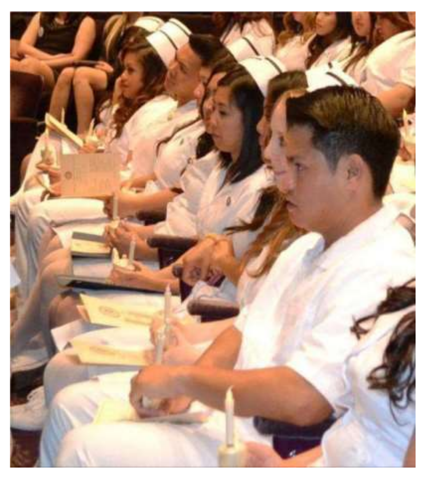
Pinning Ceremony, AUHS School of Nursing