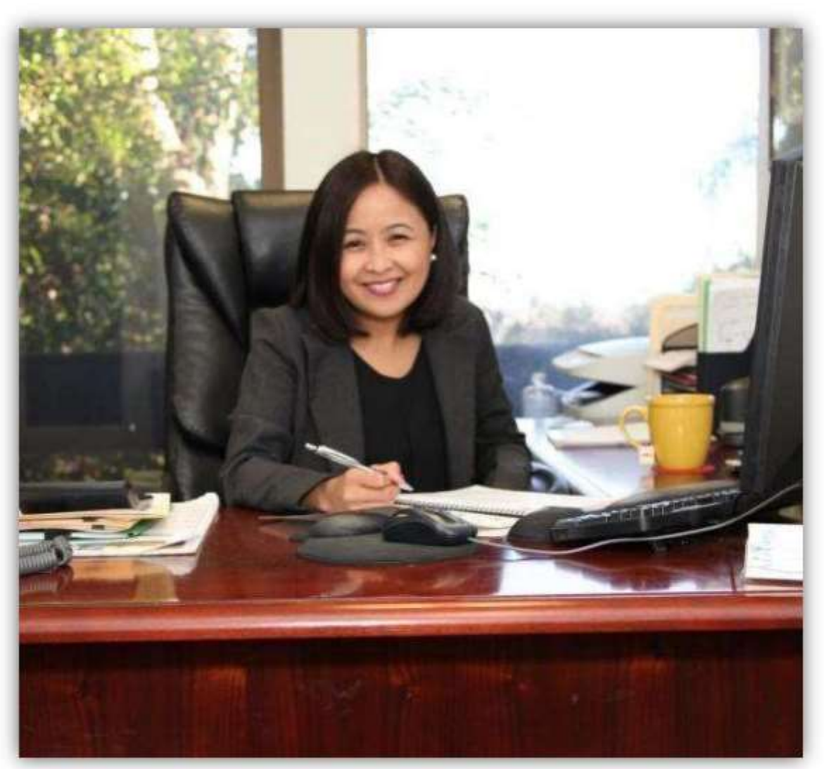
Office of the Student Affairs and Services