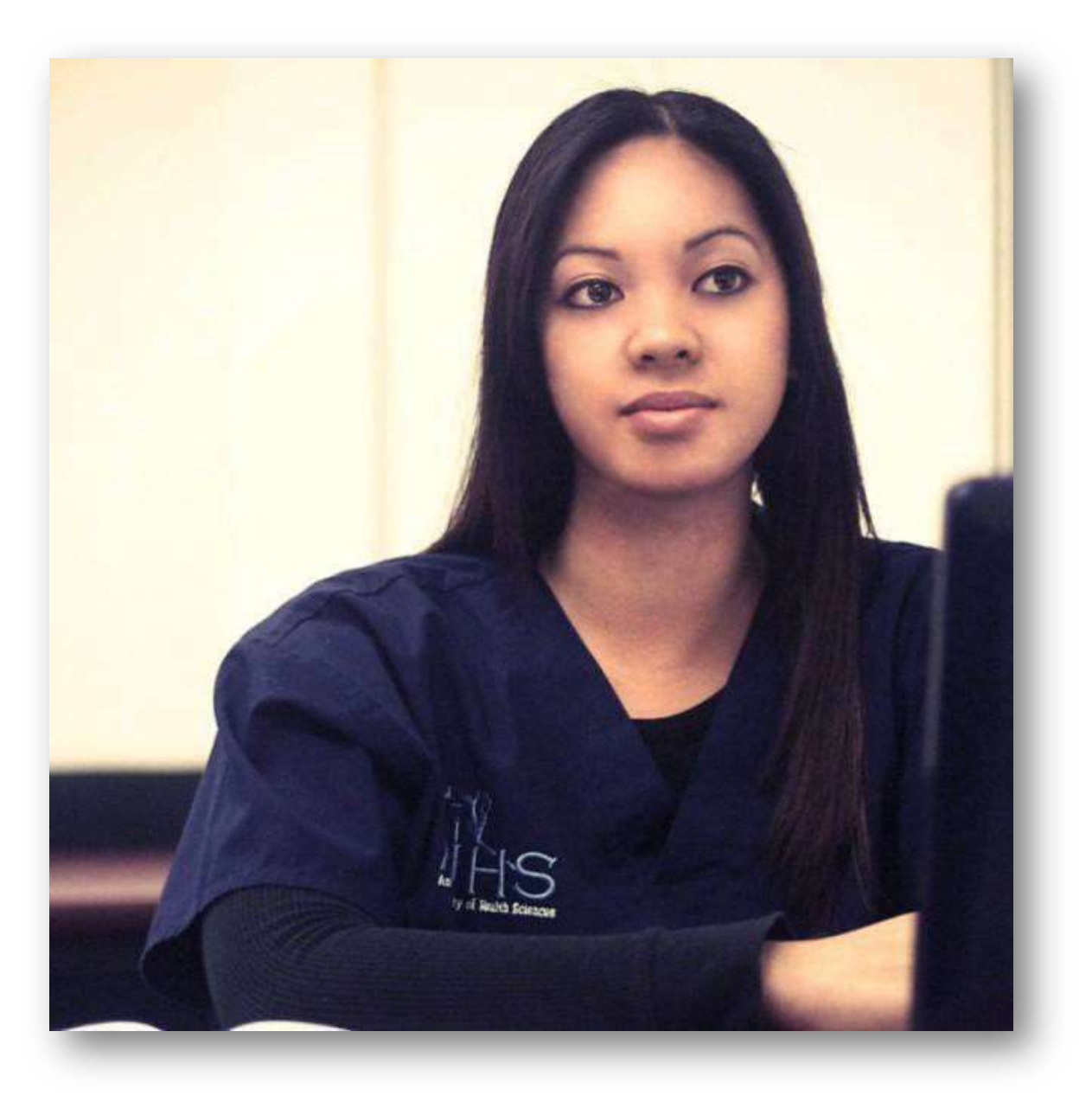
Student, School of Nursing during lecture

"I pray that out of his glorious riches he may strengthen you with power through his Spirit in your inner being, so that Christ may dwell in your hearts through faith. And I pray that you, being rooted and established inlove, may have power, together with all the Lord's holy people, to grasp how wide and long and high and deep is the love of Christ, and to know this love that surpasses knowledge—that you may be filled to the measure of all the fullness of God." ~ Ephesians 3:16-19