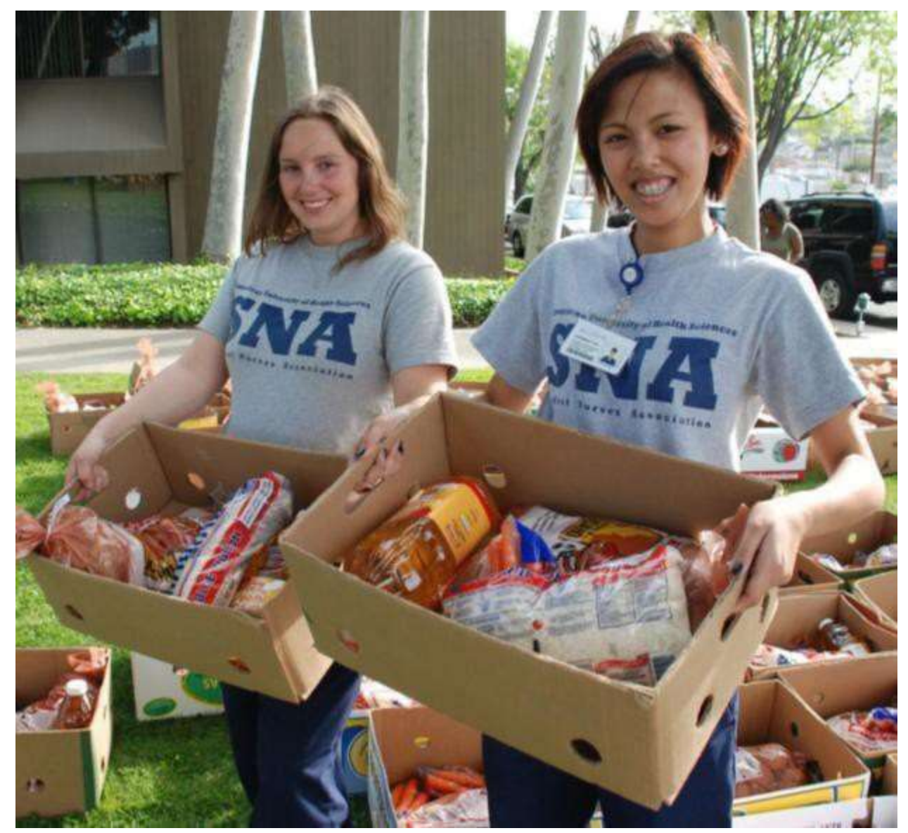
Nursing Students giving away meals for the "Acts of Love" holiday event.

There is a dream that each of us has inside. It speaks of a better time, of a better life, of a better world. There is a voice that comes from God and shows to each, "the way", then say, "come abide". There is a need that cries, must be satisfied, requires of us to care, to help, to give, set self aside. That all might have the chance to believe, to learn, to create, to succeed.