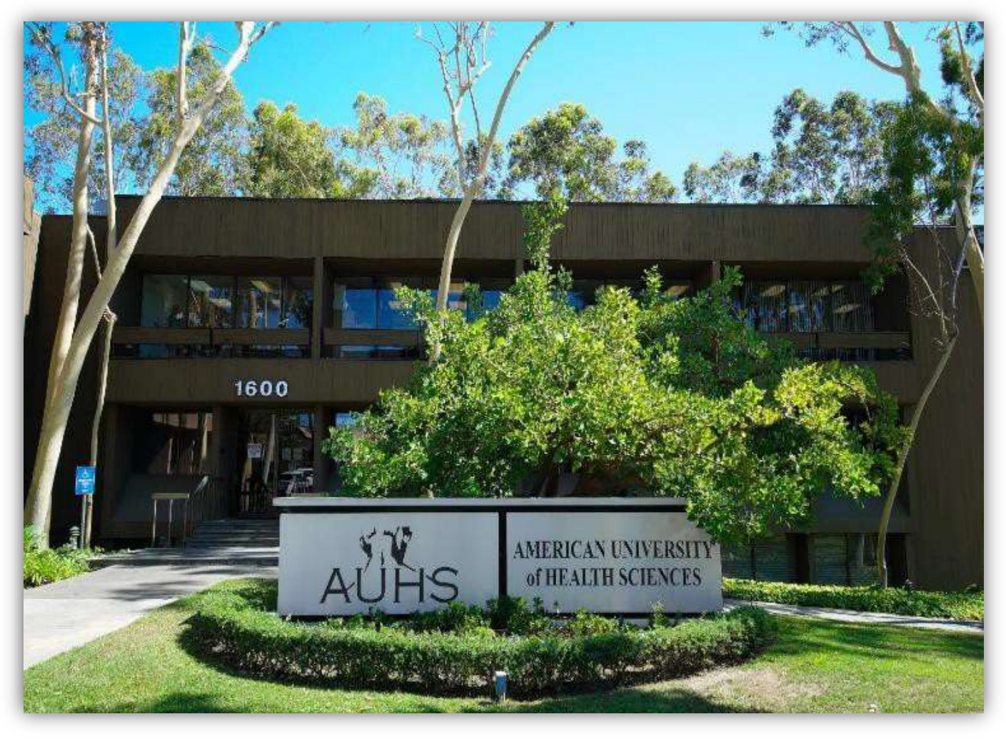
Front Façade, American University of Health Sciences Campus

"How blessed is the man who does not walk in the counsel of the wicked, nor stand in the path of sinners, not sit in the seat of scoffers! But his delight is in the law of the LORD, and His law he meditates day and night. He will be like a tree firmly planted by streams of water, which yields its fruit in its season and its leaf does not wither; and in whatever he does, he prospers." ~ Psalm 1:1-3