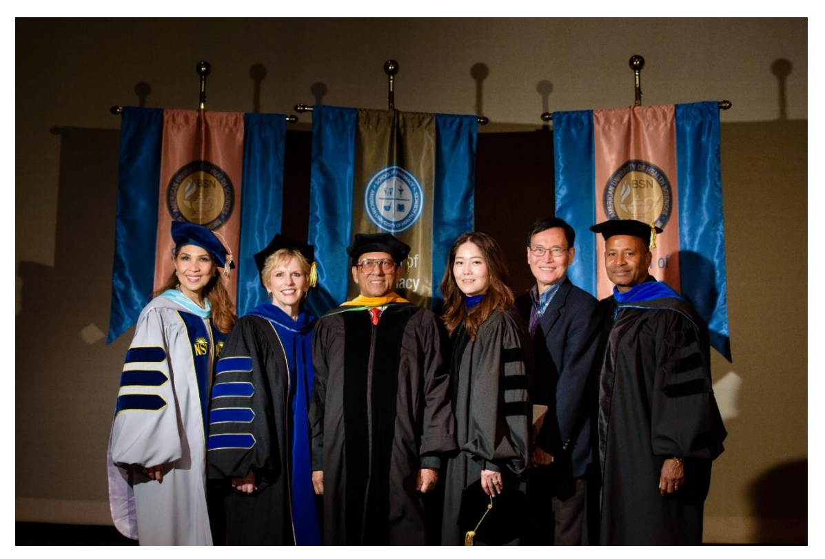
AUHS Commencement, 2018