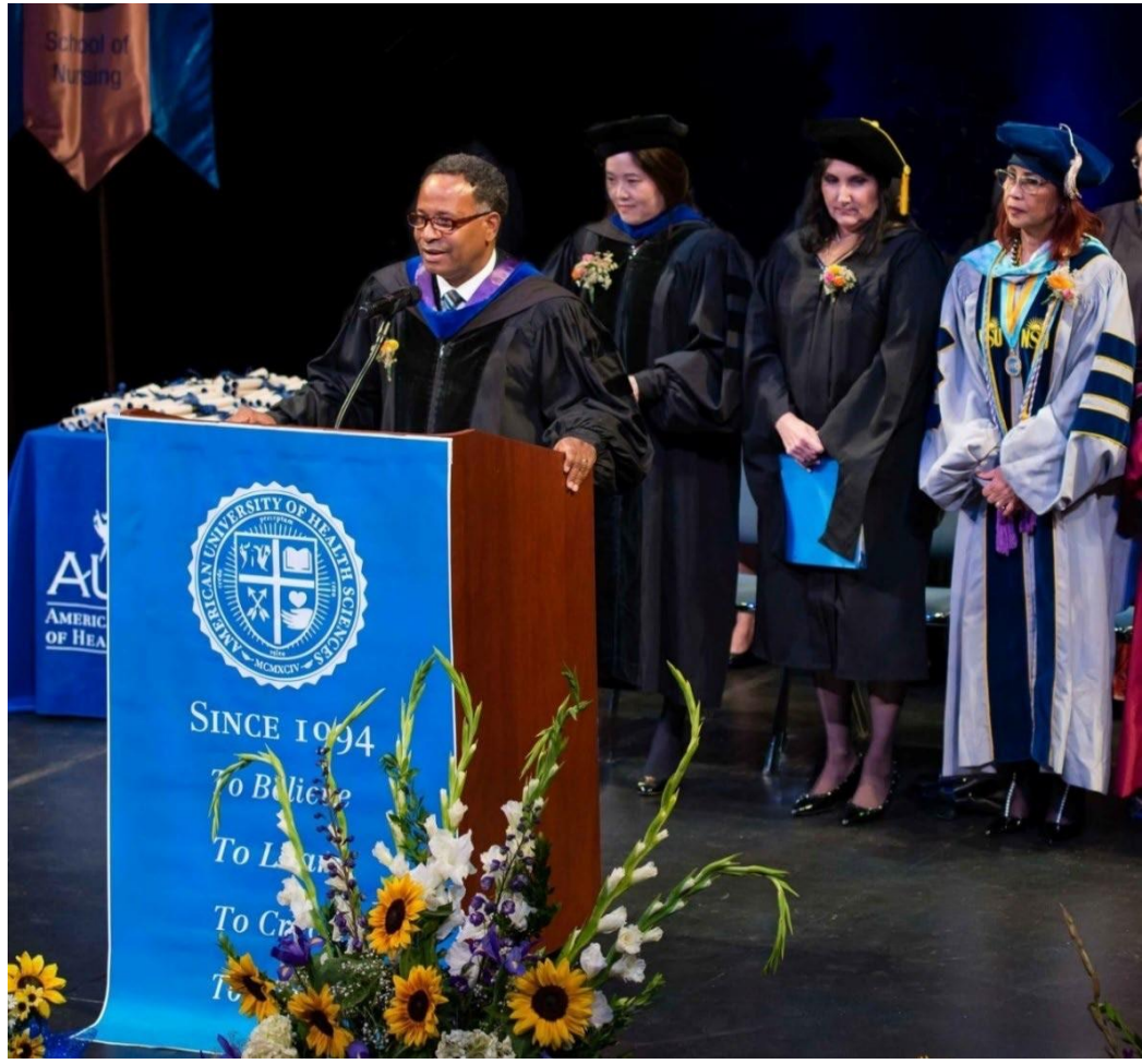
Graduation Ceremony Invocation