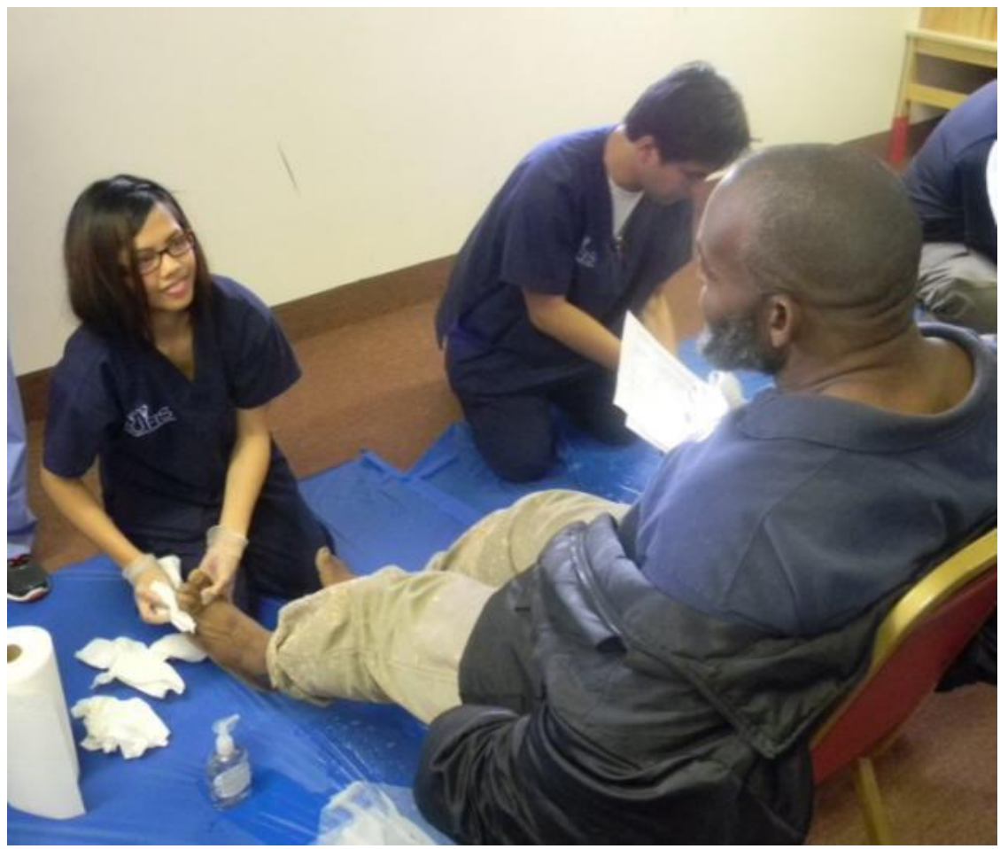
Community Service – A Core AUHS