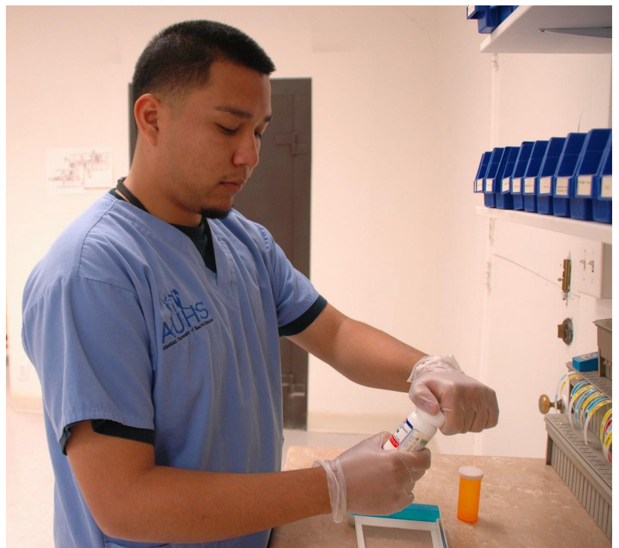
Prescription Dispensing Laboratory