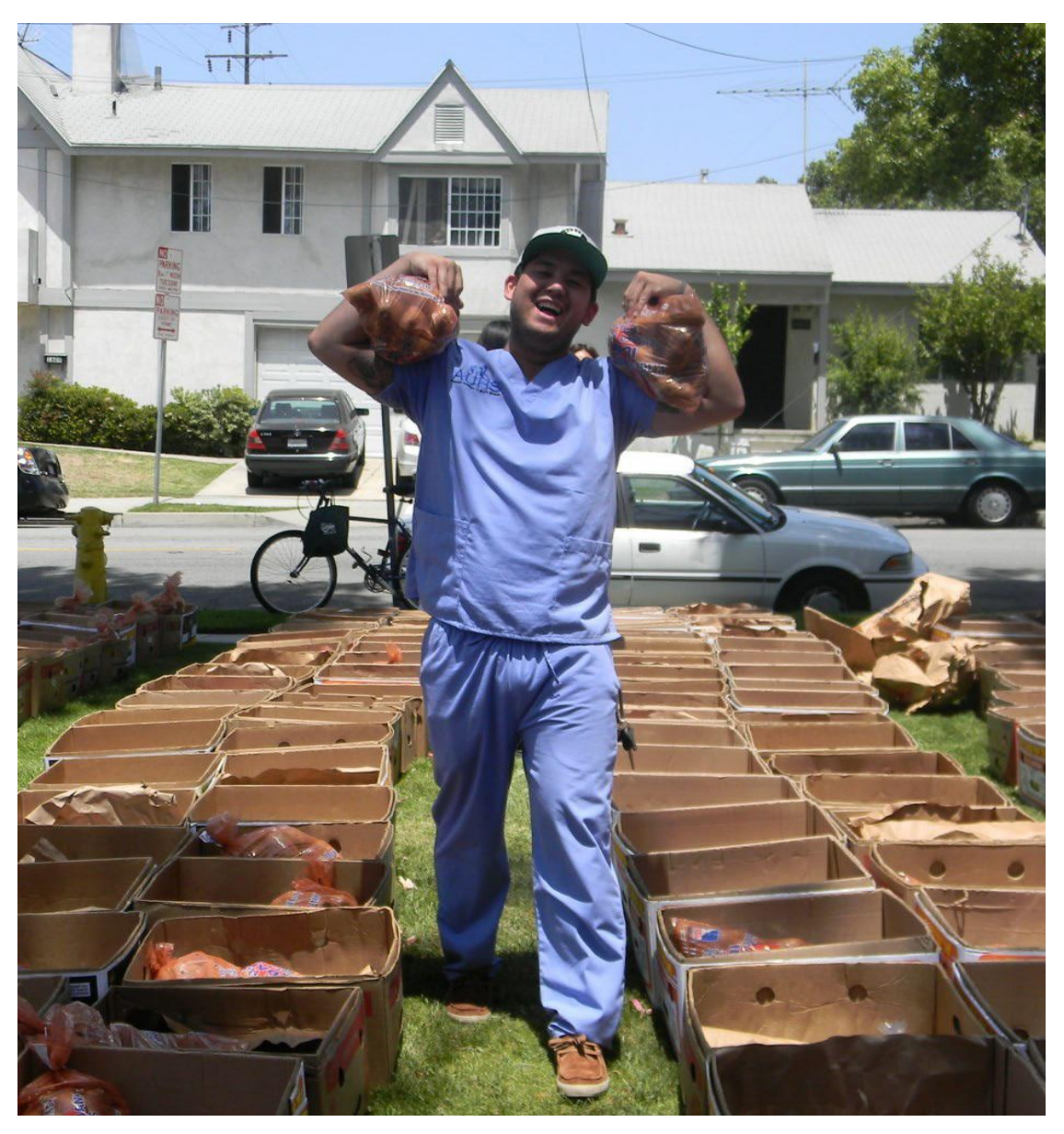
Annual Thanksgiving Food Drive