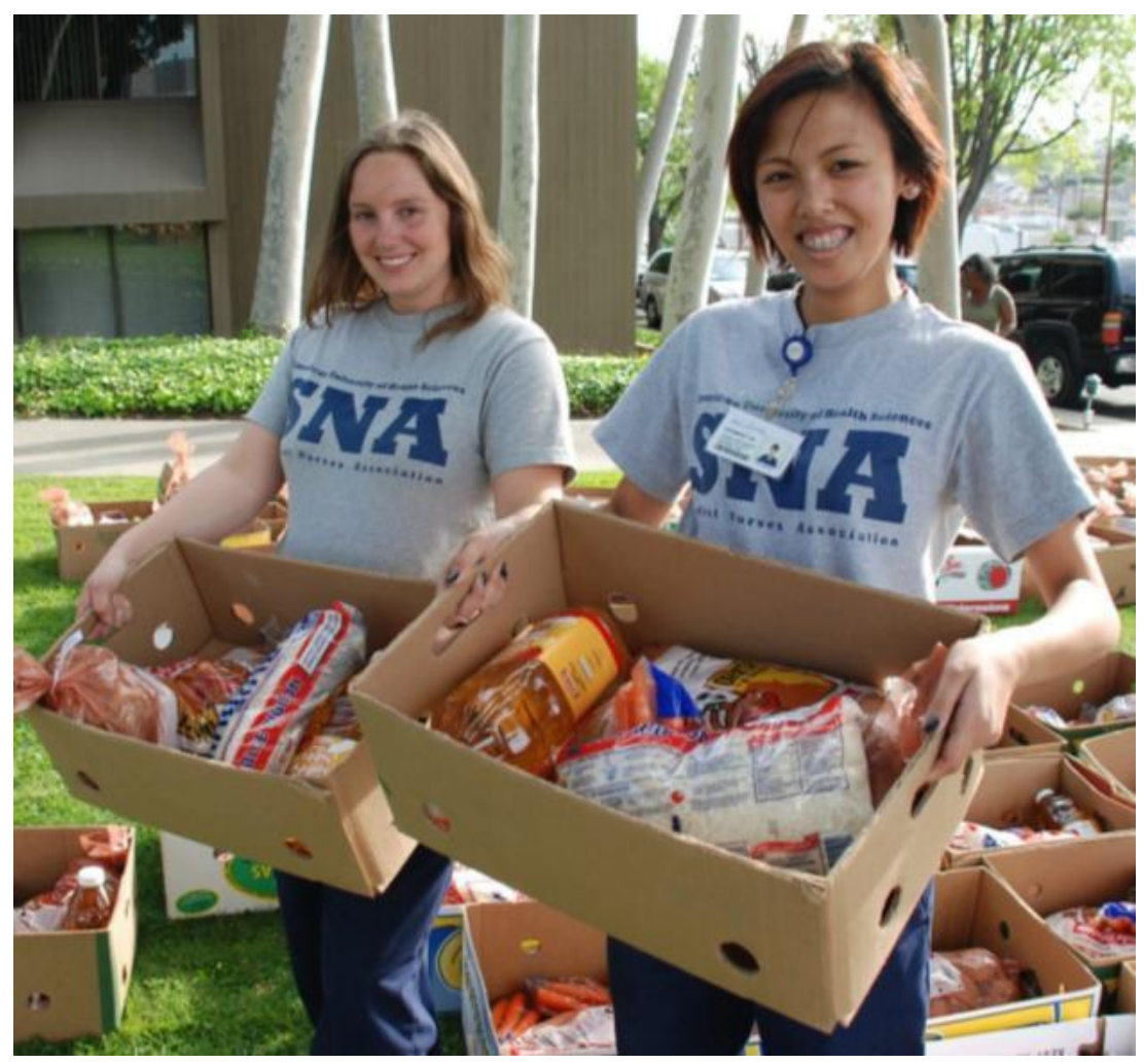
Nursing Students, giving away meals for the "Acts of Love" holiday event

There is a dream that each of us has inside. It speaks of a better time, of a better life, of a better world. There is a voice that comes from God and shows to each, "the way", then say, "come abide." There is a need that cries, must be satisfied, requires of us to care, to help, to give, set self aside. That all might have the chance to believe, to learn, to create, to succeed.