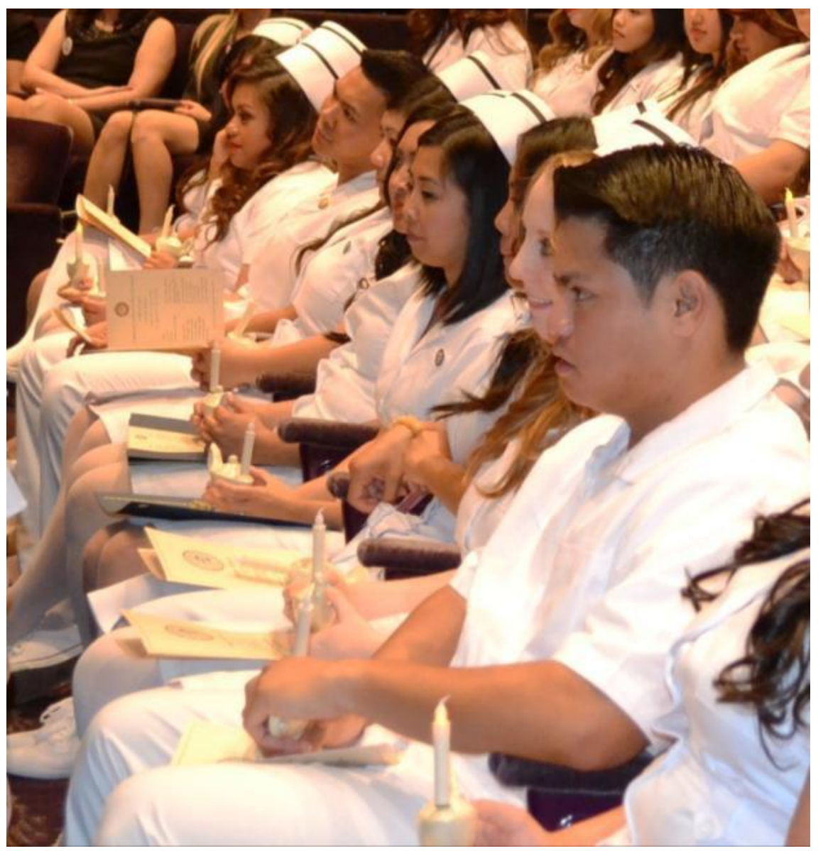
Pinning Ceremony, AUHS School of Nursing

"A good name is to be chosen rather than great riches, Loving favor rather than silver and gold." — Proverbs 22:1 —