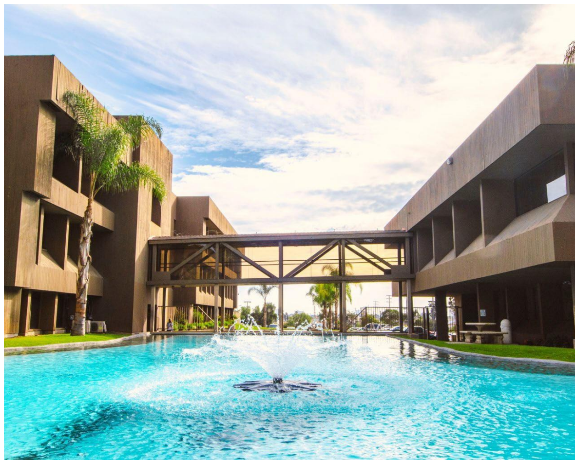
AUHS, Building 2 & 3