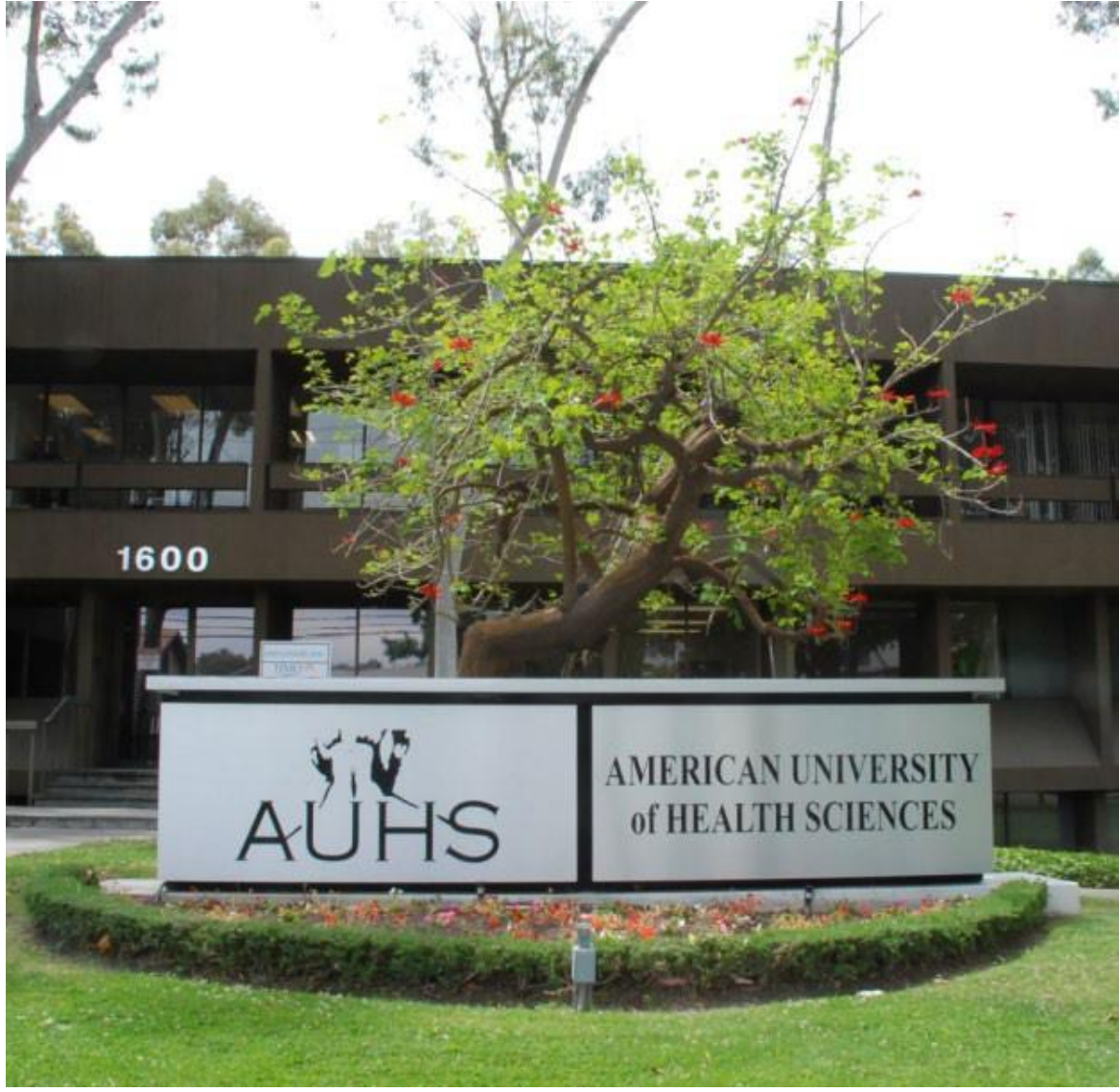
Front, American University of Health Sciences

"How blessed is the man who does not walk in the counsel of the wicked, nor stand in the path of sinners, not sit in the seat of scoffers! But his delight is in the law of the LORD, and His law he meditates day and night. He will be like a tree firmly planted by streams of water, which yields its fruit in its season and its leaf does not wither; and in whatever he does, he prospers." - Psalm 1:1-3 -