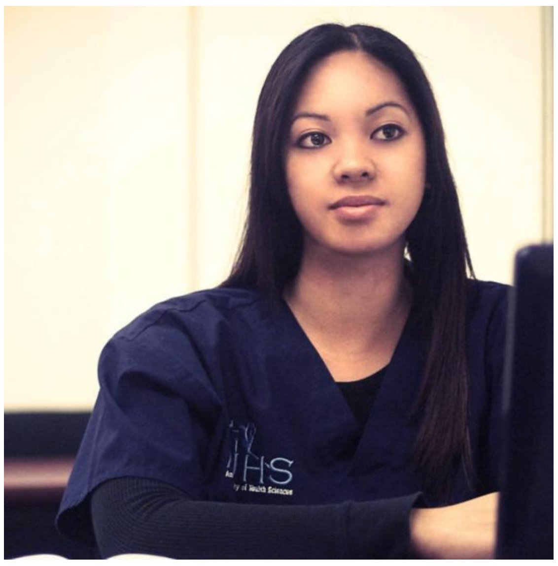
Student, School of Nursing, During Lecture