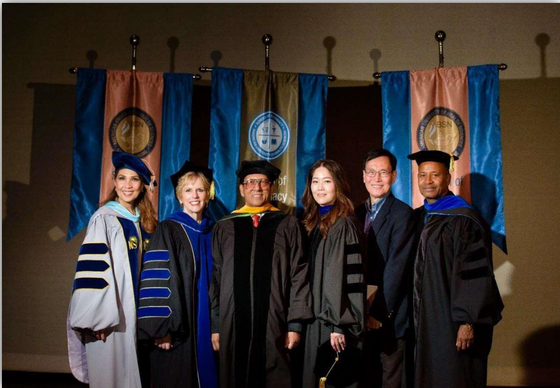
AUHS Commencement 2018