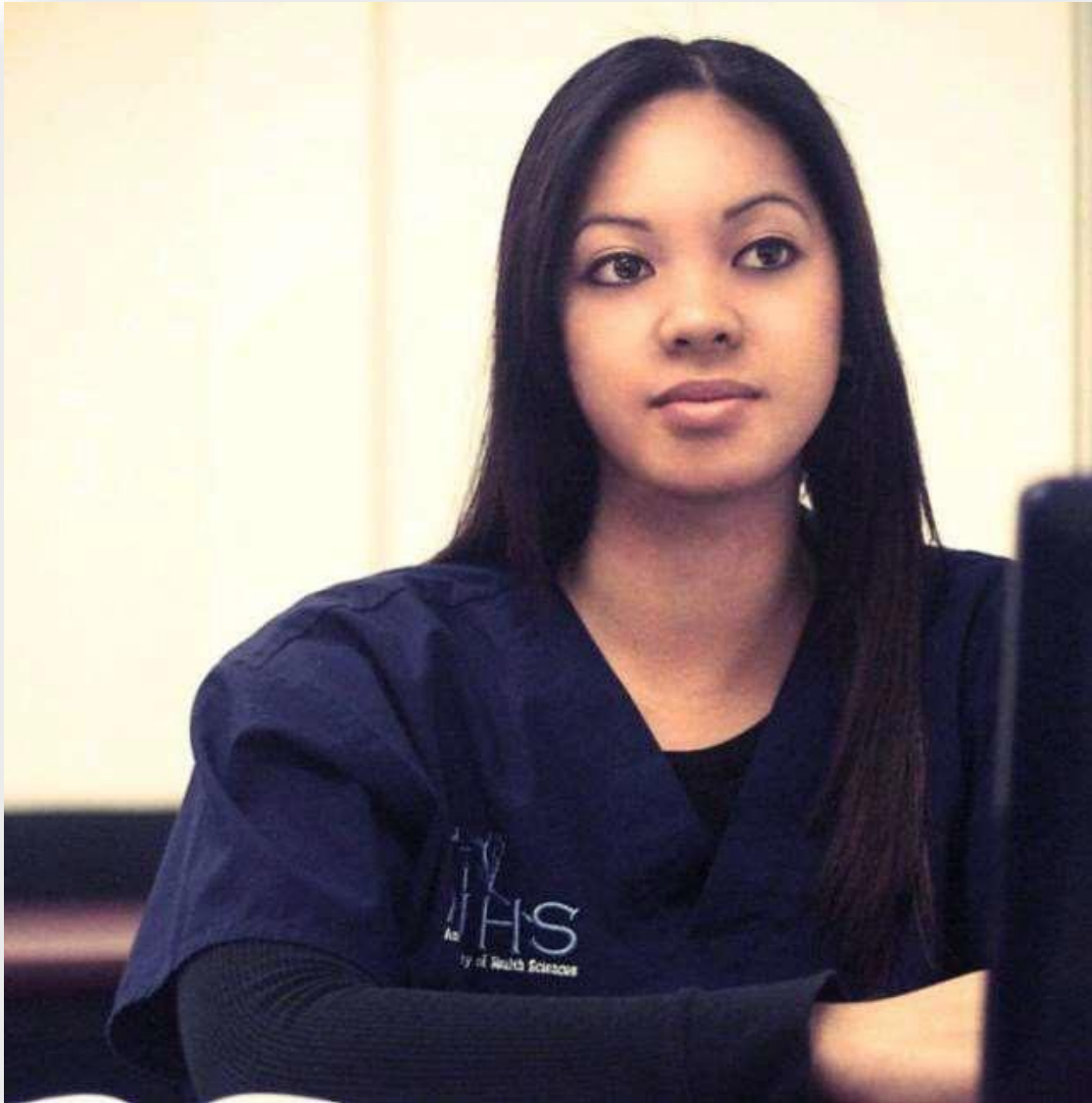
Student, School of Nursing during lecture

“I pray that out of his glorious riches he may strengthen you with power through his Spirit in your inner being, so that Christ may dwell in your hearts through faith. And I pray that you, being rooted and established in love, may have power, together with all the Lord’s holy people, to grasp how wide and long and high and deep is the love of Christ, and to know this love that surpasses knowledge—that you may be filled to the measure of all the fullness of God.” ~Ephesians 3:16-19