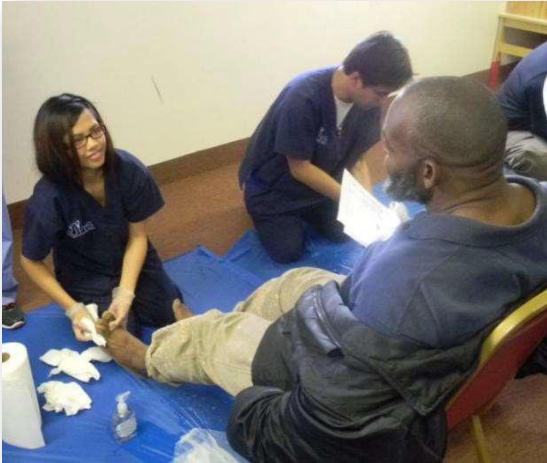
Community Service-A Core AUHS

~Martin Luther King Jr., Strength to Love