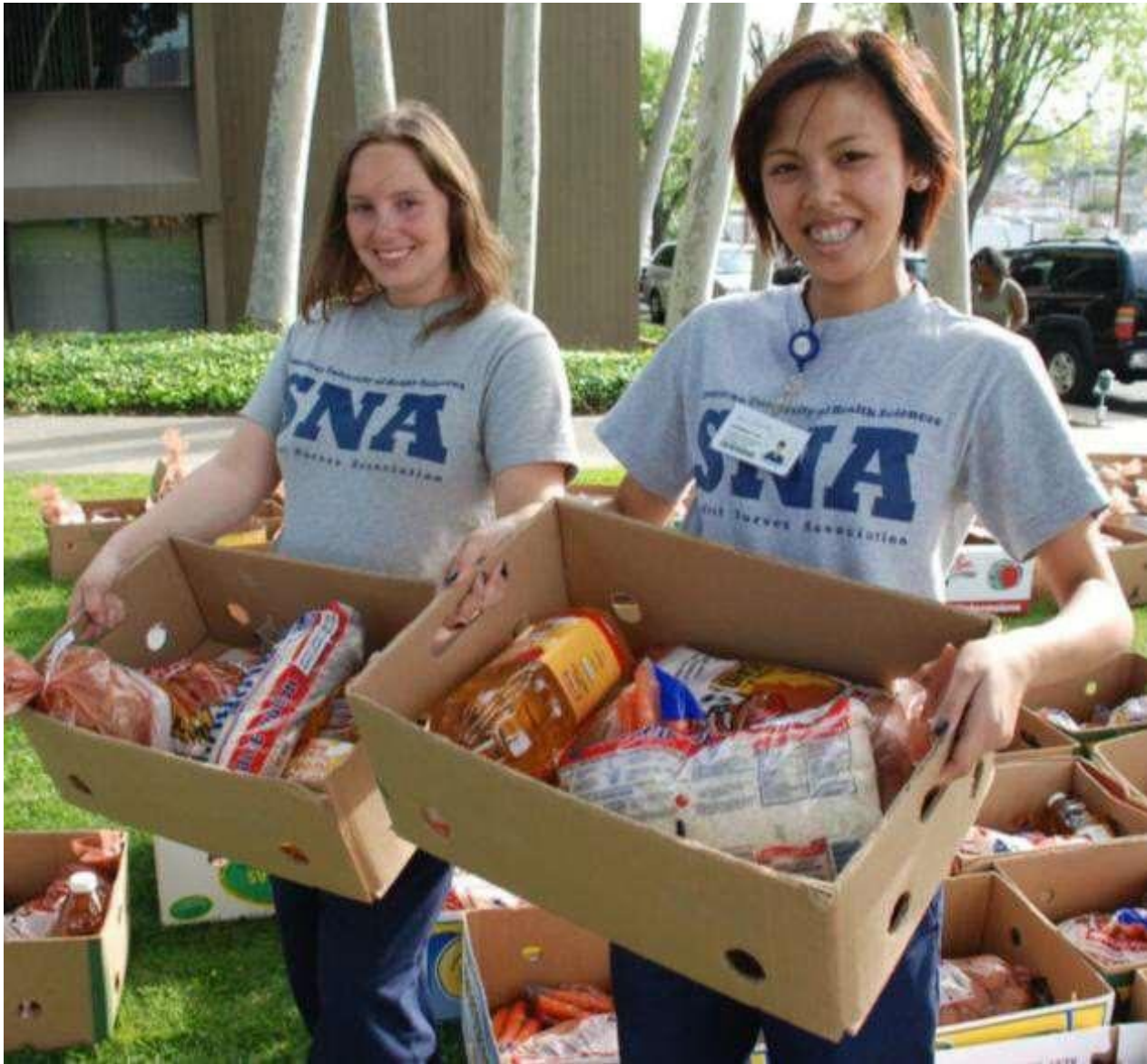
Nursing Students giving away meals for the "Acts of Love" holiday event.

That all might have the chance to believe, to learn, to create, to succeed.