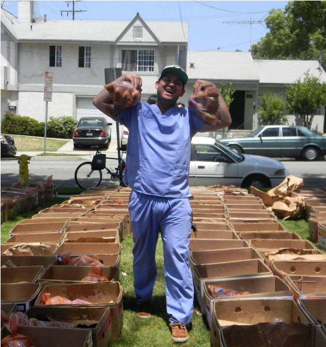
Annual Thanksgiving Food Drive