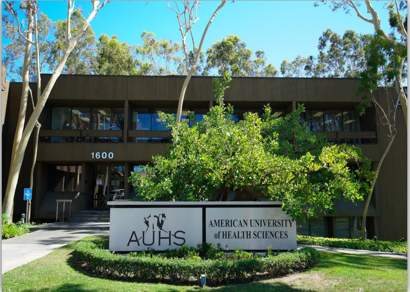
Front, American University of Health Sciences

“How blessed is the man who does not walk in the counsel of the wicked, nor stand in the path of sinners, nor sit in the seat of scoffers! But his delight is in the law of the LORD, and His law he meditates day and night. He will be like a tree firmly planted by streams of water, which yields its fruit in its season and its leaf does not wither; and in whatever he does, he prospers.” - Psalm 1:1-3