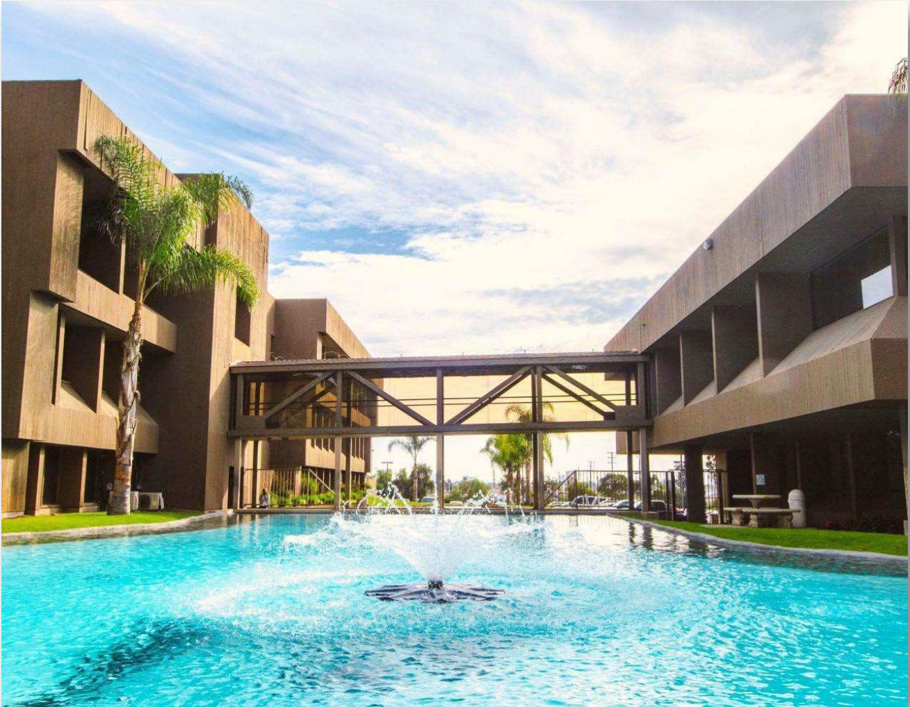
AUHS Building 2 and 3