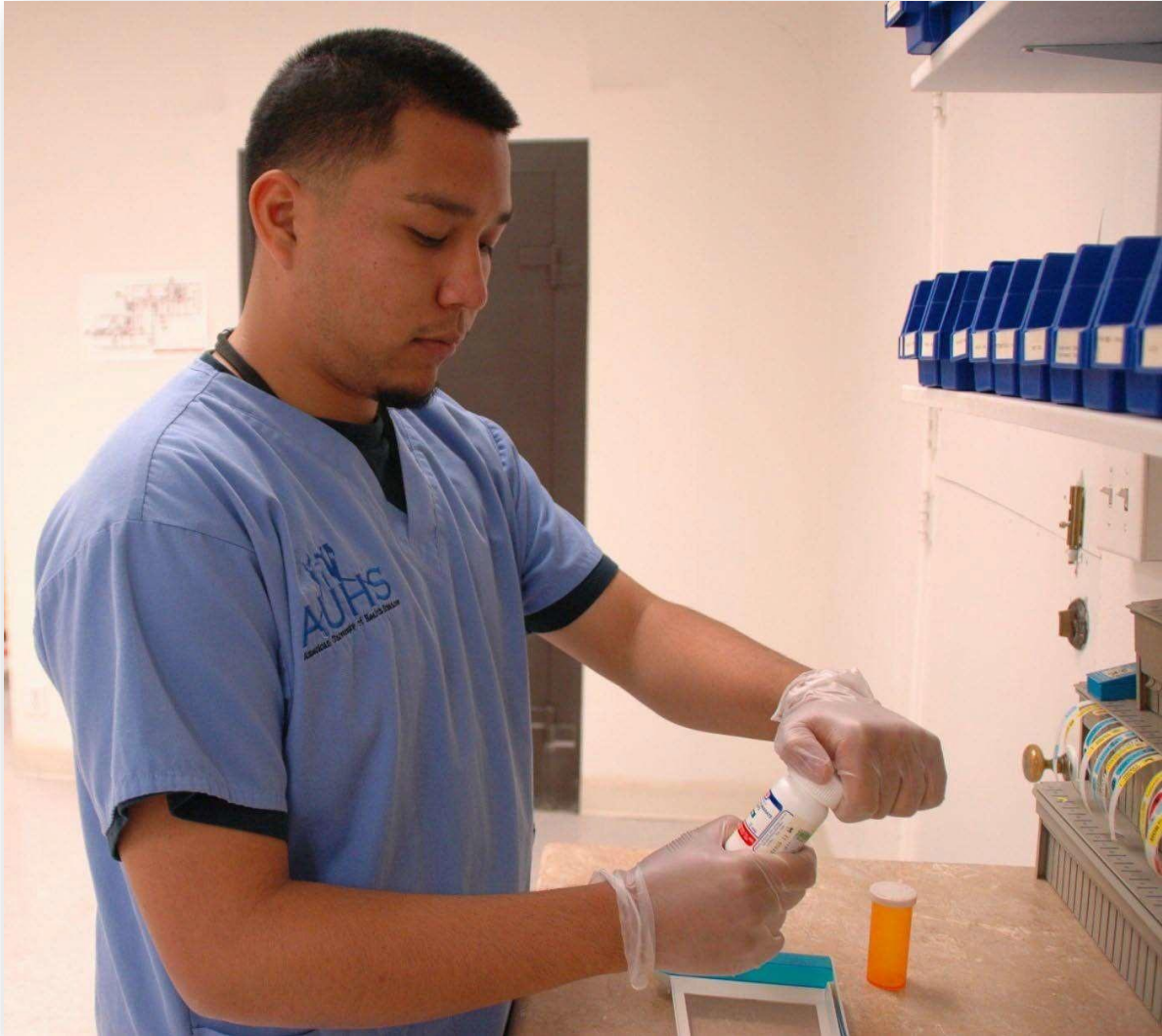
Prescription Dispensing Laboratory