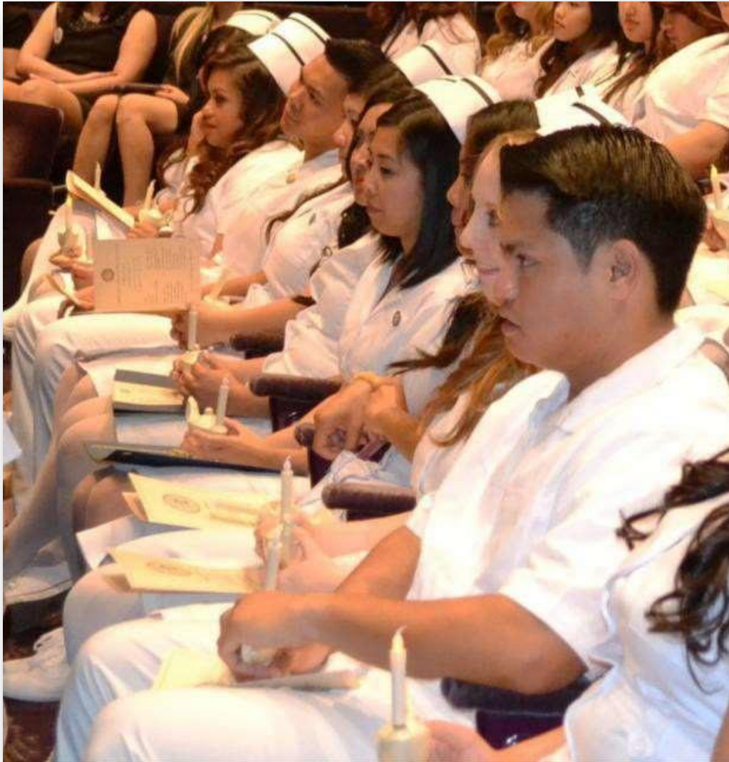
Pinning Ceremony, AUHS School of Nursing

“A good name is to be chosen rather than great riches, Loving favor rather than silver and gold.” ~ Proverbs 22:1