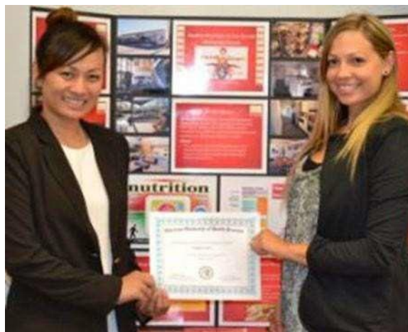
B.S. in Nursing, Student Poster Session

A degree program that is unaccredited or a degree from an unaccredited institution is not recognized for some employment positions, including, but not limited to, positions with the State of California. Student enrolled in an unaccredited institution is not eligible for federal financial aid programs.